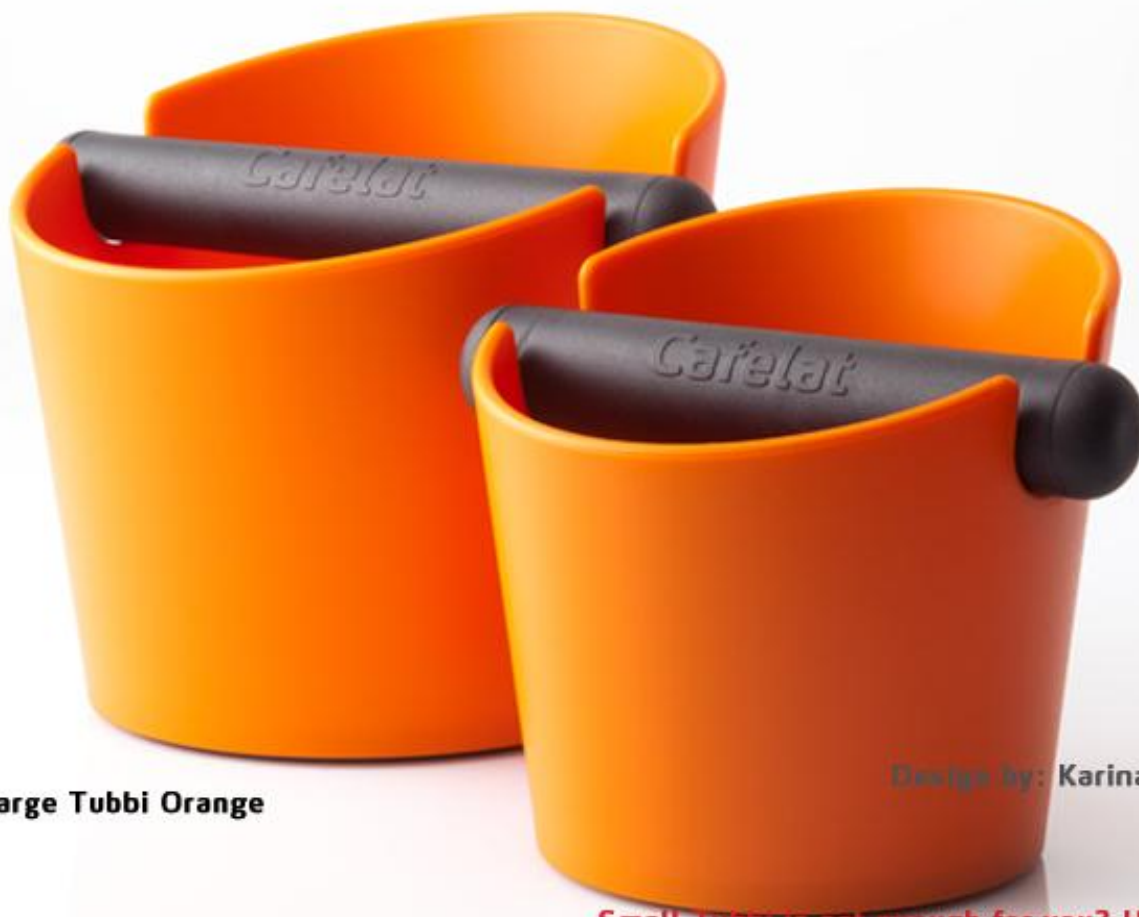
Small Tubi Orange