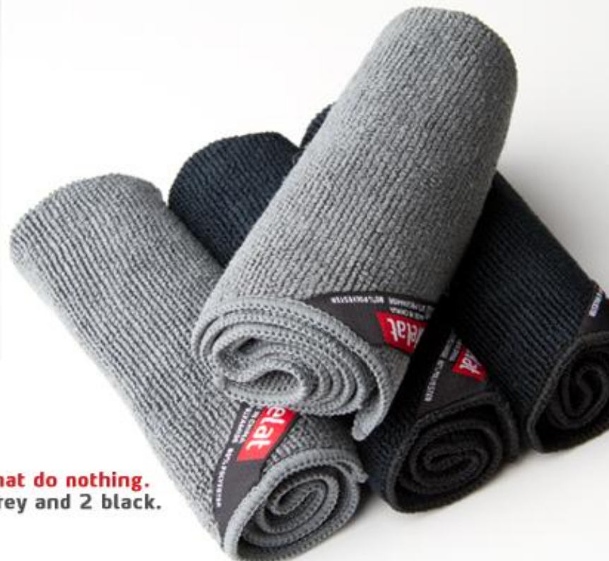
Micro-Fibre Cleaning Cloths

Don't be fooled by poor quality micro-fibre cloths that do nothing. These work brilliantly and come in a pack of 4, 2 grey and 2 black.